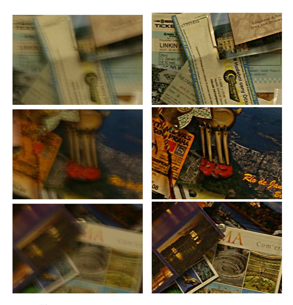
Fig. 2. Close-ups of images in Figure 1: The left column shows three different details of the first input image and the right column shows the corresponding sections in the estimated output image. Best viewed electronically.