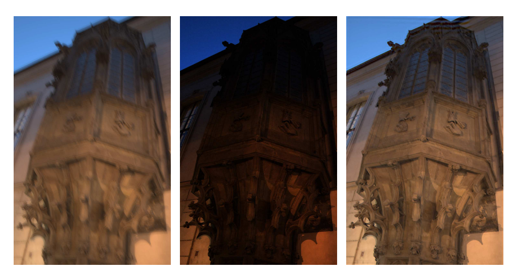
Fig. 3. A night photo (1550 \times 980 \text{ pixels}) taken from hand with shutter speed 2.5s (left). The same photo was taken once more at ISO 1600 with 2 stops under-exposure to achieve a hand-holdable shutter time 1/30s (middle). The right image shows the result of algorithm [23] that fuses the information from both. Best viewed electronically.

In principle, in this case, known blind deconvolution methods such as [17] could be applied locally and the results could be fused. Unfortunately, it is not easy to put the patches together without artifacts on the seams, not mentioning time complexity. An alternative way is to use first the estimated PSF's to approximate the spatially varying PSF by interpolation of adjacent kernels and then compute the image of a better quality by the minimization of the functional (5). The main problem of these procedures is that they are relatively slow, especially if applied on too many positions. We investigated the latter idea for the purpose of image stabilization in [23] using a special setup that simplifies the involved computations and makes them more stable.