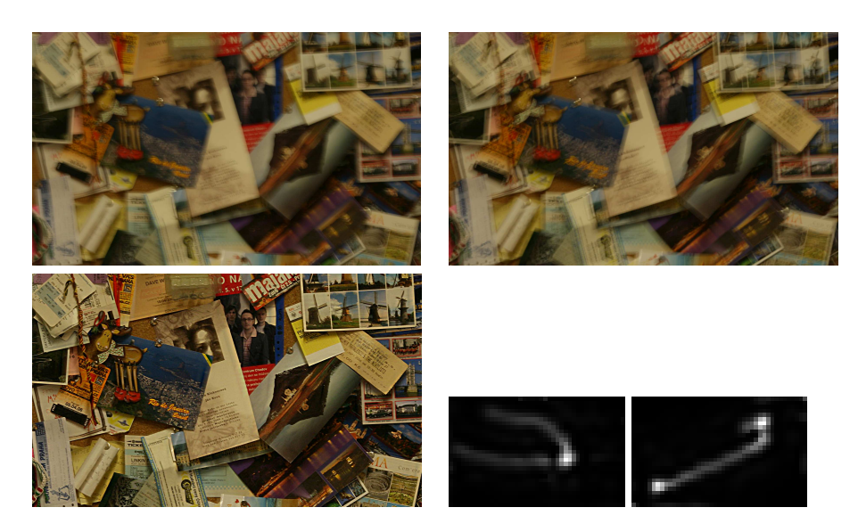
Fig. 1. Multichannel blind deconvolution of a scene degraded by space-invariant blurs: The two photos (1800×1080 pixels) on the top acquired by a common digital camera are blurred due to camera shake. The bottom left image shows the estimated sharp image from the two blurry ones using the blind deconvolution algorithm. The bottom right image shows the estimated PSF's (50 × 30 pixels). Best viewed electronically.

much smaller. Then, we upsample the estimated PSF's to the next scale and use them as initial values for the deconvolution on this scale. This procedure repeats until we reach the scale of the original input images.